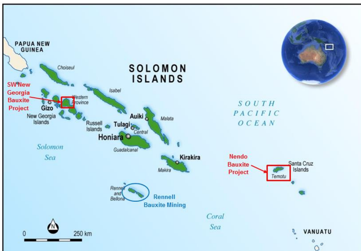
Figure 2 – Solomon Islands Project Locations

The Company will continue to aggressively pursue the matter for the benefit of all stakeholders and will update the market as required.