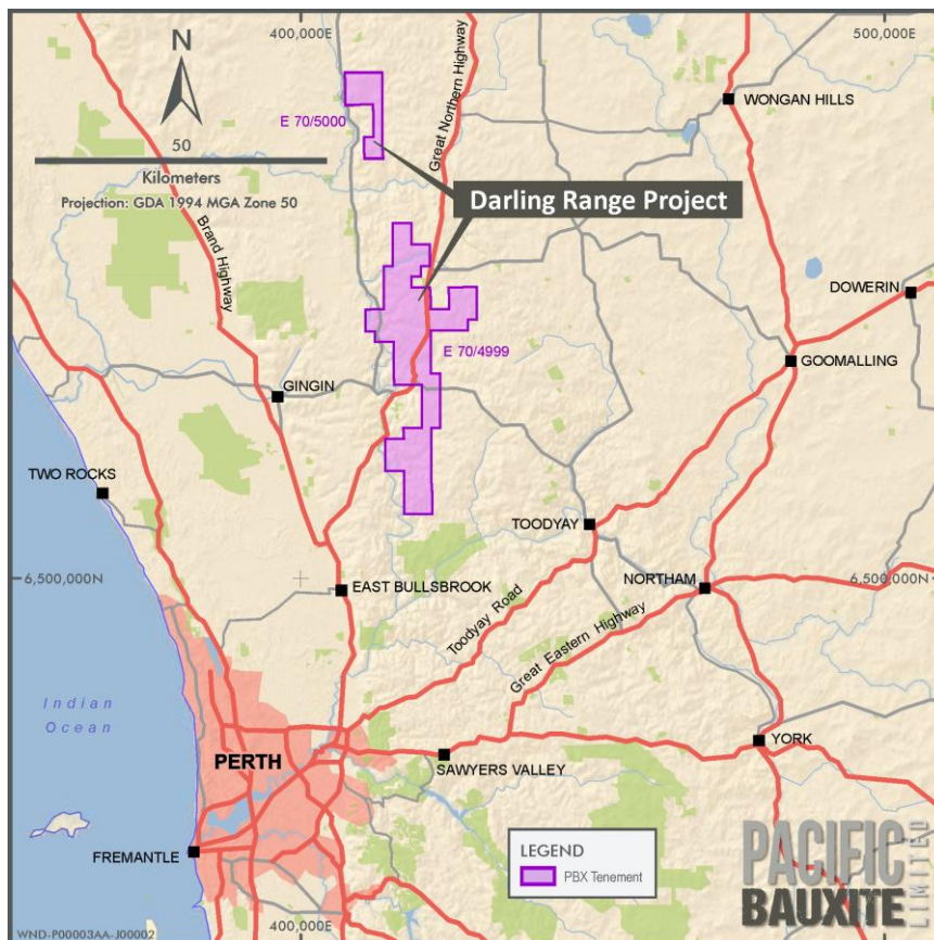
Figure 3 – Darling Range Project Location

The Darling Ranges host extensive bauxite resources and have a long history of exploration and mining. Production commenced in the region in the 1960's and it currently hosts major bauxite mining operations including South 32's Worsley Alumina and Alcoa.