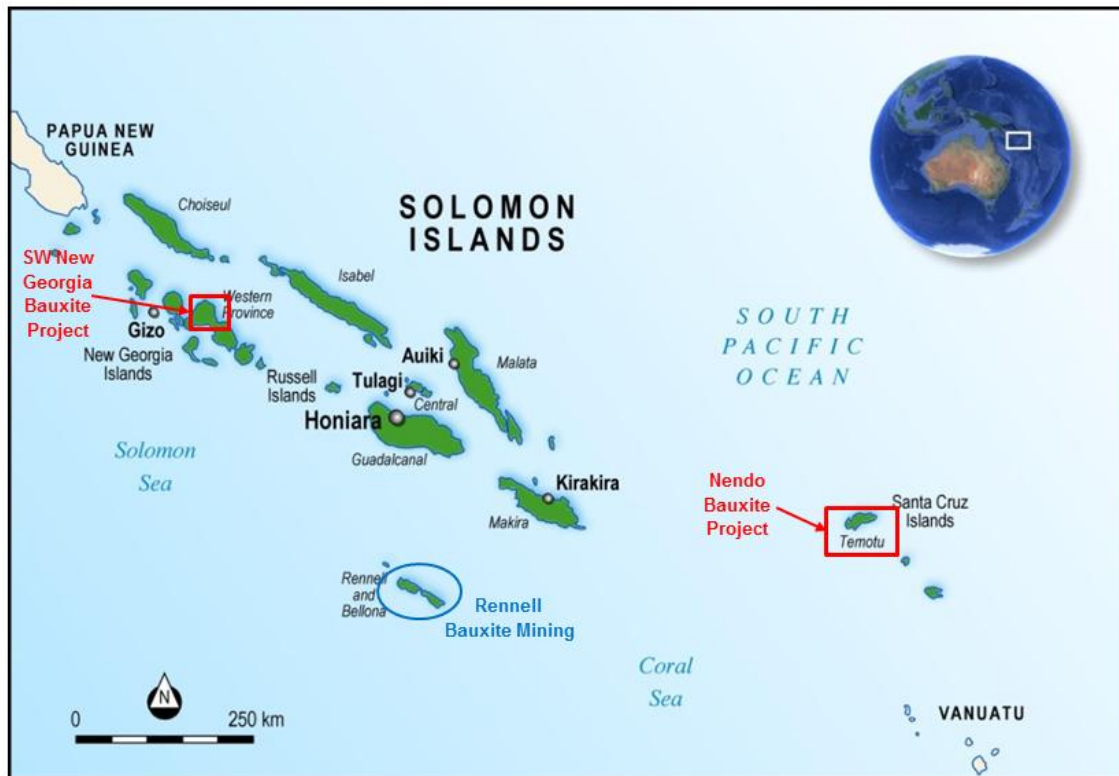
Figure 1 – Project Locations